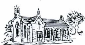
Holy Trinity Church, Frankfield

As most parishioners are now aware major repairs are well underway to tackle long term damp problems in a number of walls and part of the roof. The weather has been unkind and delayed the works so the scaffolding may well be in place till after Christmas.